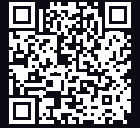
RUTX09 360° VIEW