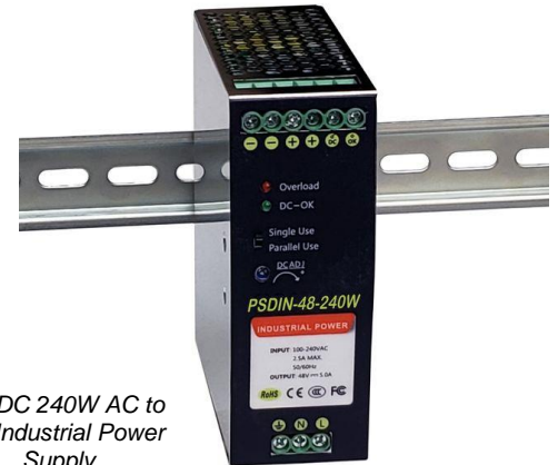
48VDC 240W AC to DC Industrial Power Supply