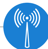
Wireless Service Provider