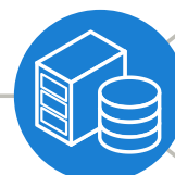
Asset Management Platform