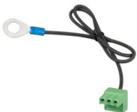
Connector with preassembled DC minus cable (included)