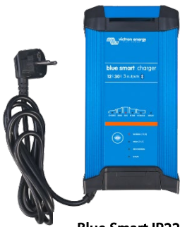
Blue Smart IP22 12/30 (3)