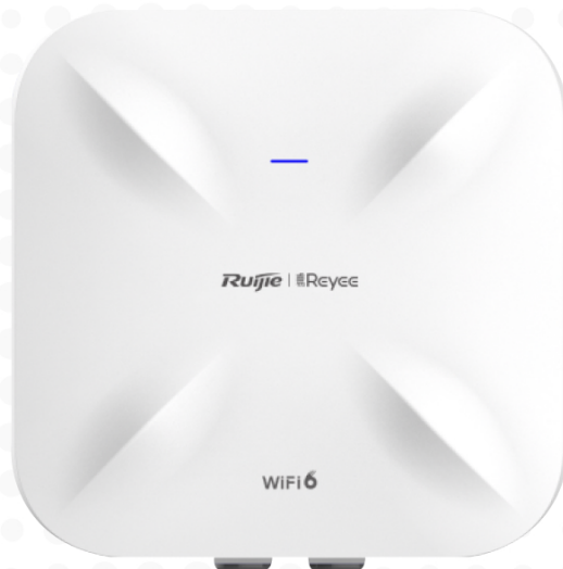
Figure 1-1 RG-RAP6260(G)