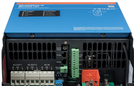
Connection Area MultiPlus-II 3k