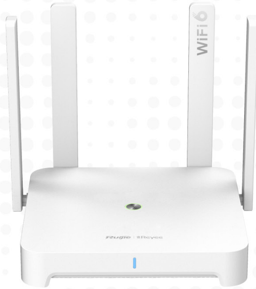
RG-EW1800GX PRO (FRONT)